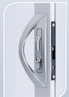
Available in all colours